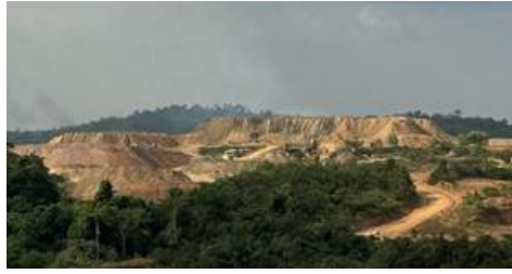
Figure 3: Pad 5 Extension