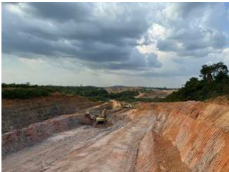
Figure 2: The Heap Leach operation showing the second lift on Pads 3 and 4